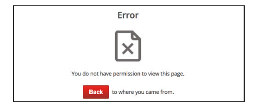
Figure 8.2. KODI sign-in error message